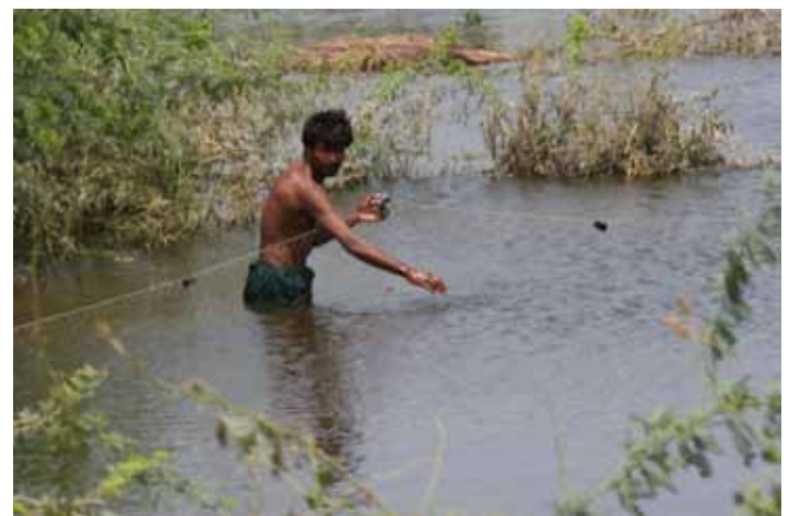
Businesses and farmland – people’s livelihoods – are under water.