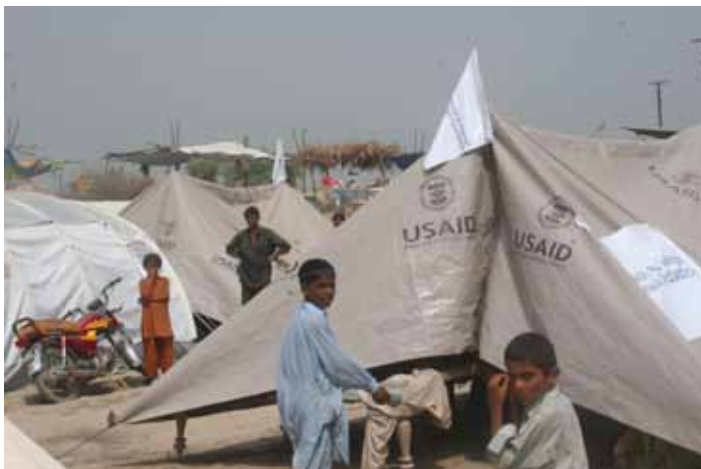
Providing appropriate shelter is just one of many challenges for the camps.