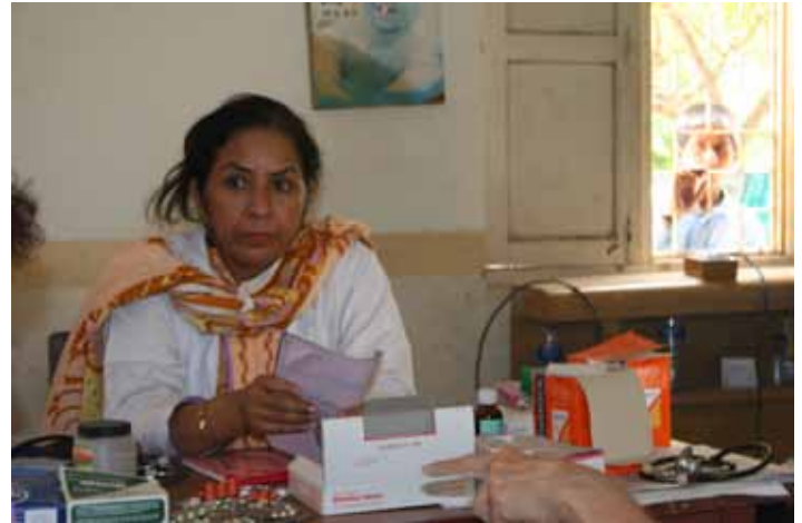
The doctor at the clinic supported by Pakistan Women's Foundation for Peace.

These individuals – at least the ones with whom we spoke – don't want to return to the rural areas once the crisis is over. "What is left there for us?" says one of the men, dashing handsome with flashing eyes and enormous charisma despite being without a real sense of future. "We have lost our homes. We have lost our animals.