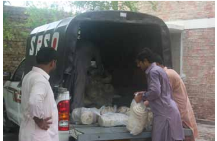
SRSO is coordinating relief efforts, distributing food and supplies to survivors.

A third shares a story about a woman who is living in an abandoned school, caring for her children and working as a tailor to earn