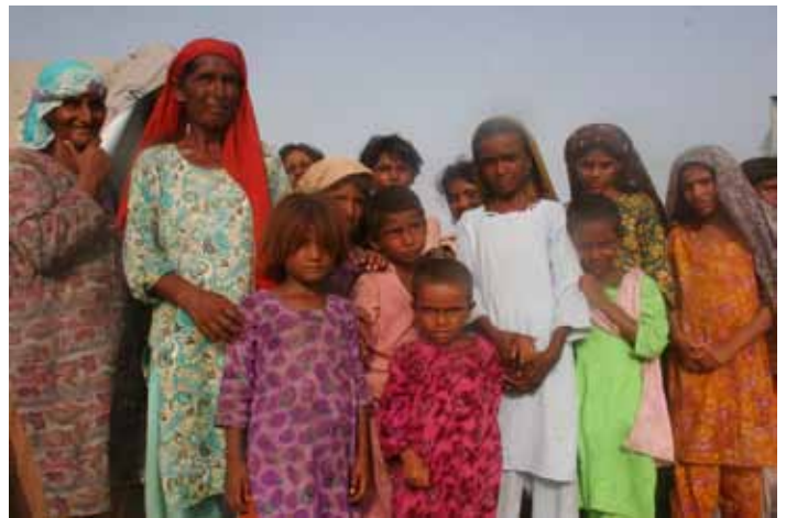
The crisis in Pakistan is an opportunity for a global humanitarian effort, a new way of thinking about relief efforts.