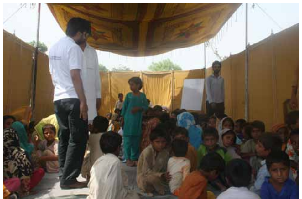
Some camps are erecting schools for children.

In the late afternoon sun, we visit a camp called Kandhkot in Sindh, organized and run fully by the Mahvash and Jahangir Siddiqui Foundation. Fields of green sprawl