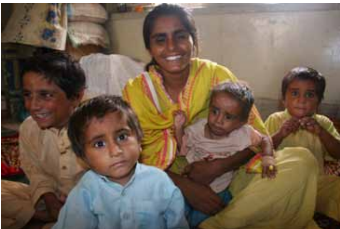
Portrait of a family.