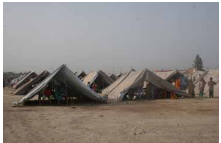
Tents offer little relief from the heat and little sense of security.

and everything else you can imagine. Think of your family suddenly stranded and living beneath a tent – all of you under one – with nothing but the clothes on your backs for a month. Then, try to imagine that everything you once had is gone. You have little or no education and five or six mouths to feed. Importantly, you have no connections to people with power to make things happen. What do you do? Where do you go when everything you've known is under water? So the people sit. I think that's most painful of all.