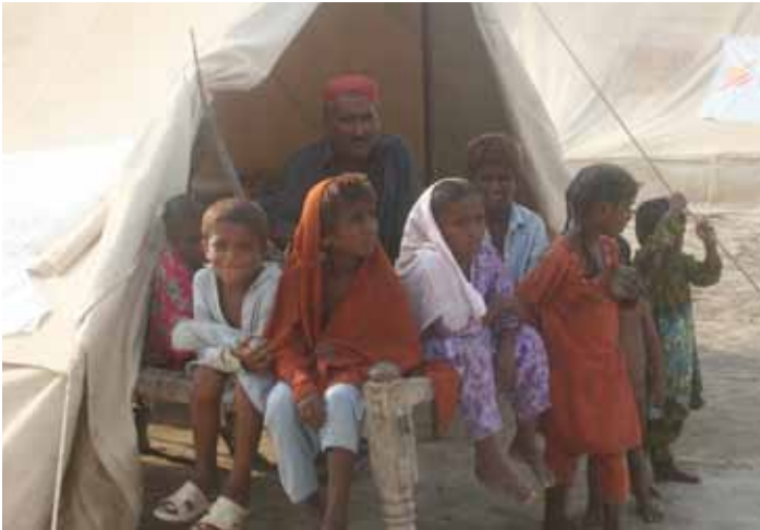
Whole families must start over.

The listlessness may have something to do with the fact that the heat is intense – it must be over 100 even after sundown. But that can't explain it all. Who we are and what we believe we can be has everything to do with what we become.