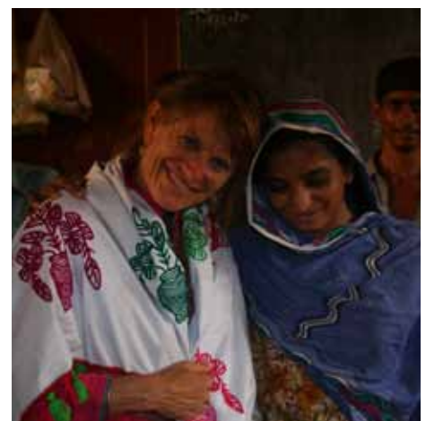
The buyer and creator of the embroidered tablecloth.

"Thirty dollars it is," we say. We take pictures with the young woman, and everyone smiles and laughs. Just making a single transaction like this shifts the dynamics from us as observers to participants. The interaction feels healthier. Finding work – and income – is of the utmost need to a people in danger of being further marginalized in a trap not just of physical isolation but of dependence on charity for too long as well.