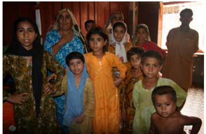
Multiple families and their meager possessions crowd the rooms of the shelter.

This is a country that has had the wind knocked out of it, and yet individuals and civil society organizations are rising up to help where they can. There seems opportunity to see the country through a different lens, one based on the potential of Pakistan's people who want a different, better future and are willing to contribute to make it happen, if given the opportunity.