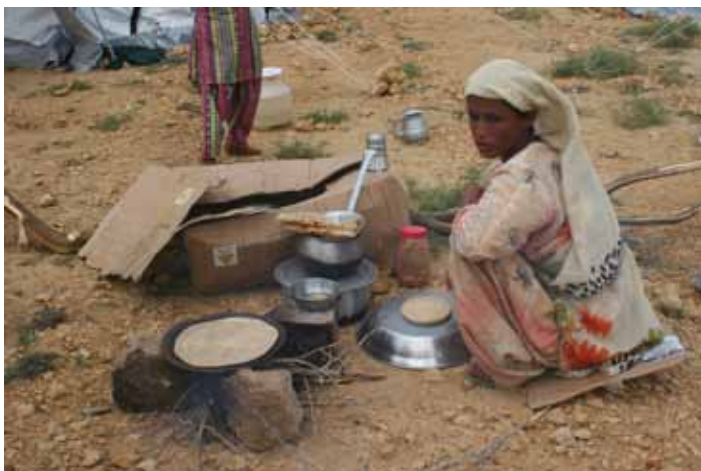
Cooking offers some sense of normalcy.

We meet a slender woman dressed in tans and pinks, squatting on a piece of cardboard beside her stove built over three big rocks,