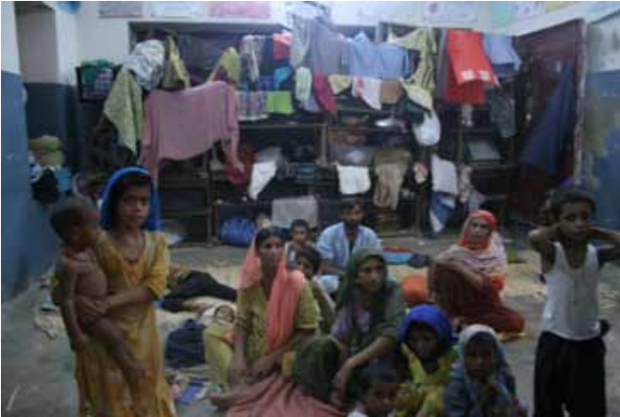
The camp in Sukkur is in a requisitioned schoolhouse.