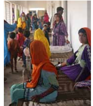
SRSO delivers food twice daily to the camp in Shikarpur, which serves 500 refugees.