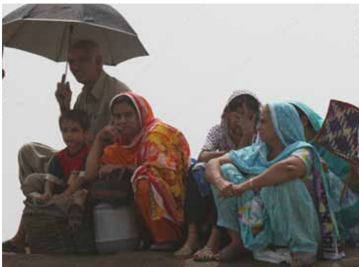
Families wait at water's edge.

A family sits on the water's edge. Among them is an old man holding a cloth umbrella, squatting on the ground. Children wave