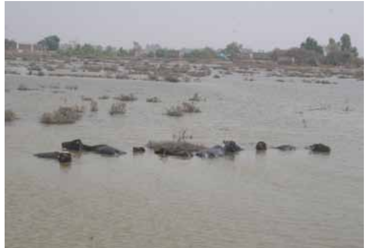
Many families have lost their livestock, their most valuable possession.