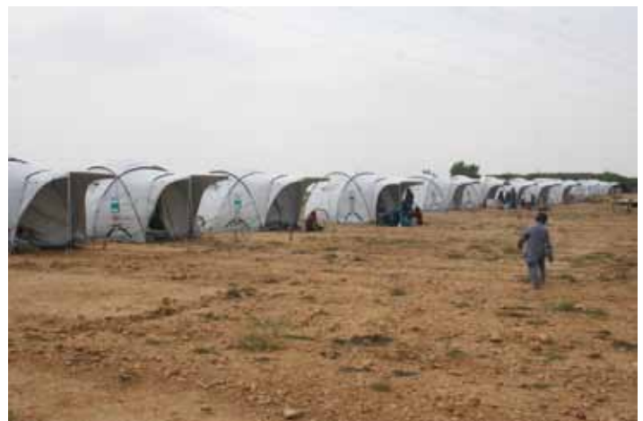
NRSP is distributing tents as well as food, water and other critical supplies.

We pass ragged communities of people living in makeshift tents along the roads. That there is any organization at all is extraordinary: in the past four days, 650,000 individuals have left their homes, and 100,000 houses have been lost. Here, people were given a day's warning to evacuate so most people were able to hold onto their belongings. I'm struck repeatedly by how little people have even in good times – a charpoy (roped bed), a few blankets, some pots and pans, a few items of clothing. Now those precious possessions make these people better off than their neighbors in Sukkur and Shikarpur, where all was lost.